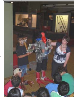
Children enjoy dressing up in costume to show the different adaptations seen in native

about creating a resource trolley containing many different educational activities for children to be able to do whilst visiting the Museum. I hope to be able to action this after attending the MEANZ conference in Wellington in February, and am anticipating that I will come back bursting with ideas!