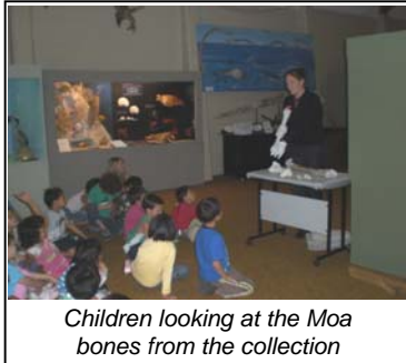
Children looking at the Moa bones from the collection

The last quarter of 2010 was a very busy time for the Education Centre with 1267 students and visitors passing through our doors. Feedback from the visitor questionnaire has been overwhelmingly positive, with typical comments being "Staff and students had a great day" and "Perfect. The activities and shared stories, resources and activities fitted our