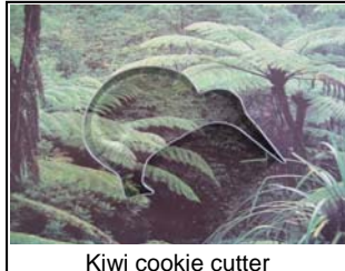
Kiwi cookie cutter

February is here! Take a moment to look into our gift shop, we're open 7 days and there's lots of neat gift ideas. The kids might like a pocket kite - the wind keeps the kite open and it folds to fit in your pocket - always ready for that gust of wind wherever you might be. For the budding cooks out there, check out the cookie cutters in the shape of a kiwi and one in the shape of New Zealand, great for those biscuits you make for special friends. How about an emergency rain coat - just the thing to put in your bag. We're open daily, 10am - 4pm - at the Kiwi House.