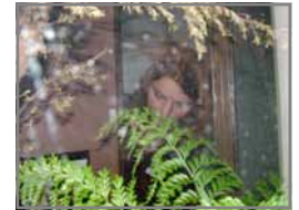
Bream Bay College Student