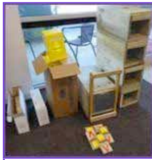
Traps donated from the NRC for pest control

Kiwi North has a large number of volunteers who do everything from delving in the archives to pest control on the 25 ha property.