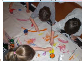
BLAST! art workshop

There was a huge uptake for the Art Education Pack which was produced by Pippa Lawlor under LEOTC, especially for Far North schools who weren't able to visit the exhibition.