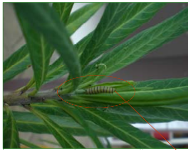
A very hungry caterpillar

Gerry also did sterling work planting some native Kauri and Pohutakawa trees.