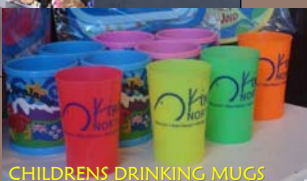
CHILDRENS DRINKING MUGS